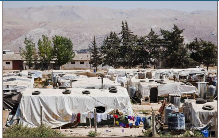
An informal settlement in the Bekaa Valley, Lebanon.

Other concerns relate to employment and education. The influx has had a significant impact on the local economy, raising prices and making it difficult for both Lebanese and refugees to find gainful employment. In Beirut, men work at odd jobs, mainly as residential building caretakers and street vendors. Syrian children are allowed to attend Lebanese schools, but due to overcrowding fewer than 100,000 of the nearly 400,000 refugee children are able to enroll.